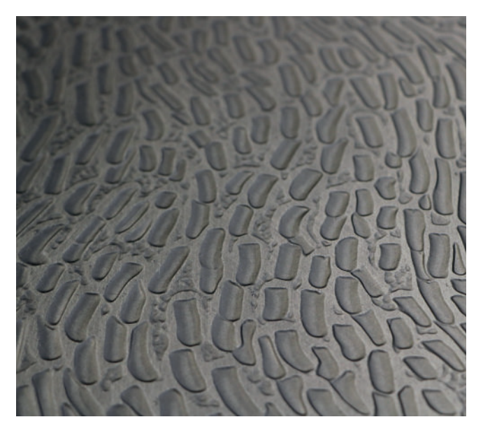
Patinated gouged material - TOPAZE collection - SIGébène