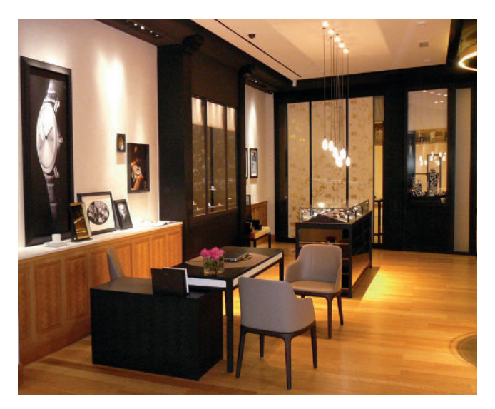
Luxury retail space layout - Lindera Signature