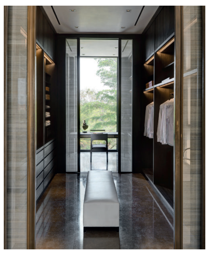
Stained walnut dressing room with glass doors and brass frames, integrated lighting - SIGébène