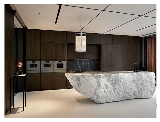
Walnut kitchen and central island in raw stone - SIGébène

Recognized for its project engineering services, attention to detail and its finishing expertise, the company has risen to the best levels of fine cabinetry by meeting the demands of national and international clients.