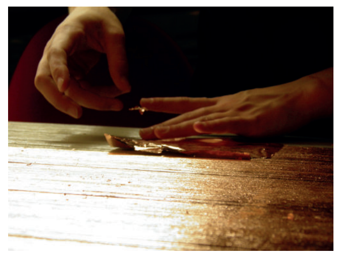
Copper leaf deposition on larch wood - SUAGE collection - SIGébène

SIGébène joins the Luxury segment of the Lindera Group, Lindera Signature comprising Technics d'Agencement , La Manufacture and Ateliers Muquet . It expands the offering dedicated to high-end markets, encompassing luxury boutiques, hotels, prestigious restaurants and exceptional private residences.