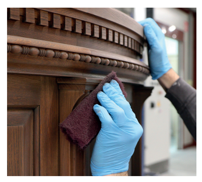
Wood finish: oak bar - patinating operation - SIGébène

All of Lindera Signature's houses share common values and a strong belief in high-quality work and customer satisfaction. Within their workshops, their employees perpetuate the traditional excellence of technical craftsmanship, while drawing on modern tools and the best project management standards in collaboration with their architect and interior-design partners.