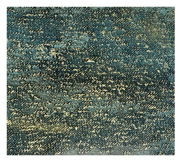
Blue lagoon gold fabric - Lindera Signature