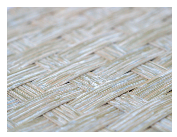
Woven oak patinated with silver leaf - SIGébène