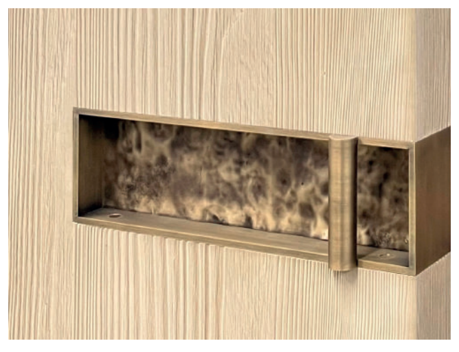
Door in brushed and distressed spruce, custom grip - SIGébène

The integration of SIGébène opens up commercial prospects in line with the ambitions of the Lindera Group .